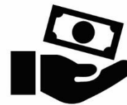
Capture and internalize land value