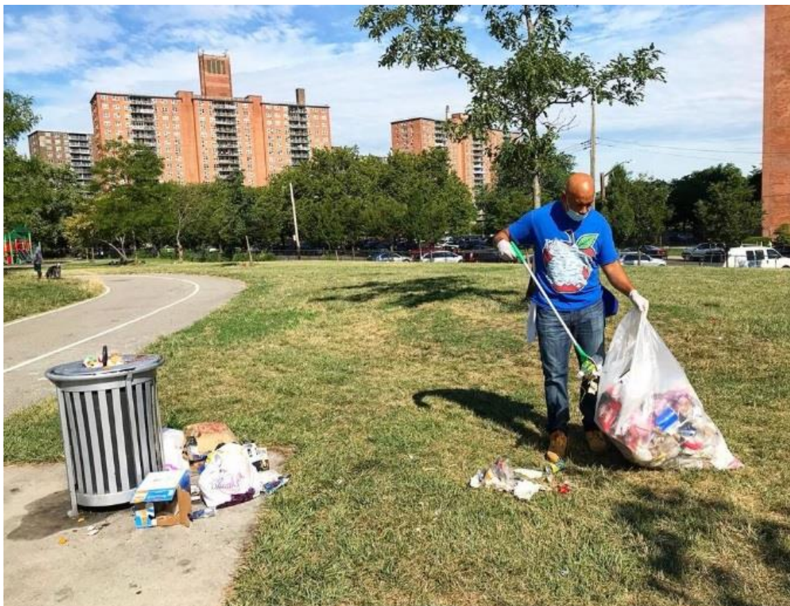
Photo: Borough President Diaz participates in a park cleanup. CLTs can help communities harness capacity and strategize to prevent, mitigate, or adapt amid environmental risk. They can also enable cleanup strategies to help preserve and promote clean living.