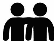
Stimulate socio-economic equity