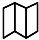
Facilitate land use adaptability and diversity

The crux of this strategy is to ensure that local residents who already live in The Bronx and compose the social fabric of this borough are the ones who reap and share the benefits of new development and improved infrastructure. This is the basis of equitable development and why CLTs can serve as such a critical component to bridge opportunity gaps for vulnerable populations in The Bronx.