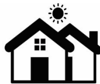
Promote affordability and ownership