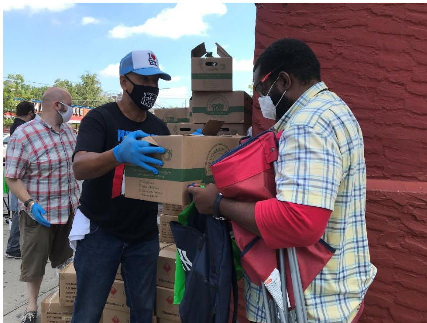
Photo: Borough President Diaz distributes food and PPE at a free event in September 2020, one of many hosted over the course of the COVID-19 pandemic.

It is probable that the gravity and acuteness of this trauma in The Bronx was heightened due to an accumulation of pressure on vulnerable populations over time, and the concentrated reaction is much like a bubble bursting. It is also possible that more autonomy over land use decisions,